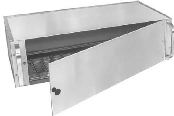
Rack with HFP52-1 Hinged Front Panel (side)